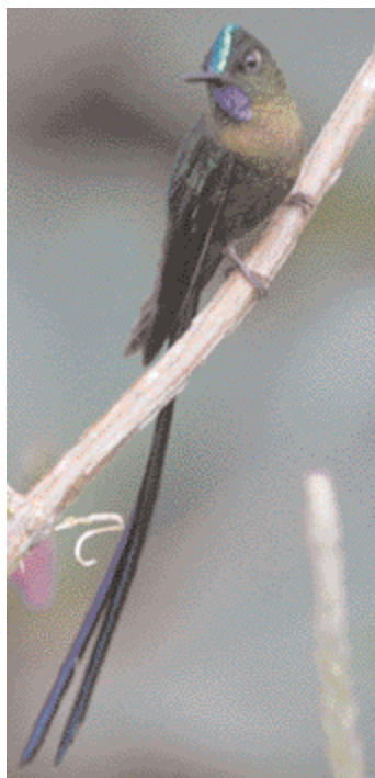
The Violet-tailed Sylph, though a common hummingbird, is a showstopper in the Ecuadorian Andes.