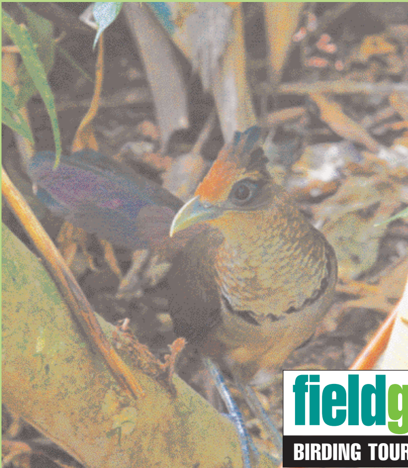
Rufous-vented Ground-Cuckoo