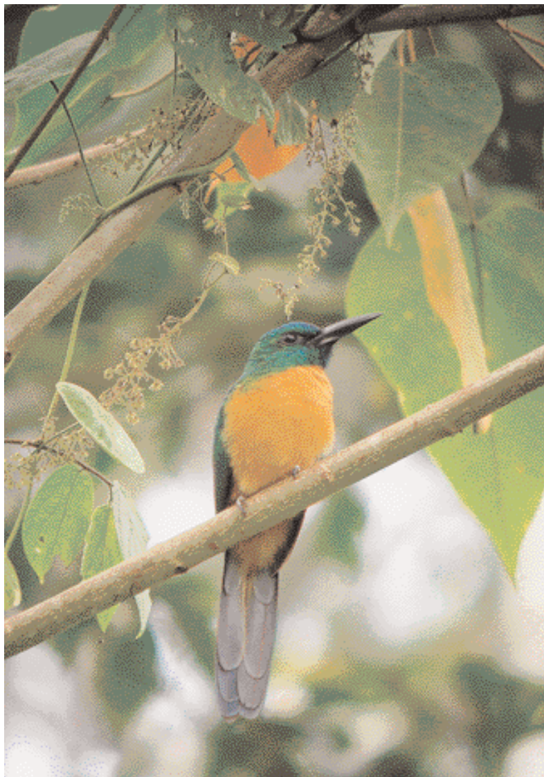
Great Jacamar

Our tours are limited to eight participants . This way we are ensured of riding in the same Canopy vehicle when we travel to and from birding sites and of having a better participant-to-ornithologist/guide ratio in the field and at meals than with a larger group. As with all Canopy birding groups, ours are accompanied by a local Tower guide who has the most up-to-date knowledge of the area and is excellent at finding birds and quickly putting them in the spotting scope for everyone to see. Yet in a small group our Field Guides can more effectively impart a wealth of knowledge that is otherwise difficult to get from local guides who have not had the breadth and depth of Neotropical experience that characterizes all our Panama guides.