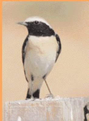
At top, a desert scene at Qitbit Spring, United Arab Emirates. Above, two birds of the region are the Desert Wheatear (right) and, the star of the show, the Hypocolius (left). The latter is in its own family and has a range restricted to parts of the Middle East.