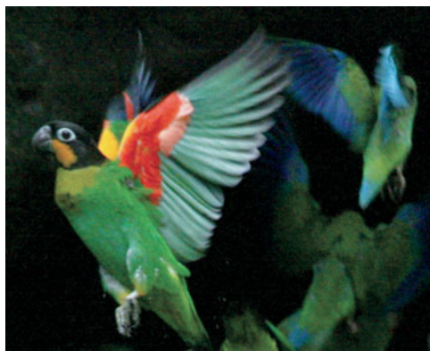
Orange-cheeked Parrot and Cobalt-winged Parrotlet, Sacha Lodge, Ecuador, by guide Dave Stejskal, September 2011

To put it mildly, the three streams are at flood level—it’s just incredible how much we can know, go, and show these days. Knowledge about birds, their taxonomy, distribution, habits, and ID is accumulating at an astounding pace. Access to new or better birding sites around the world continues to grow (is there a corner we can’t reach?). And between all of the birders out there digiscoping or hauling DSLRs or now-tiny video cameras, are there many species left we have not yet photographed? From an information and access standpoint, what an amazing time to be birding. Let’s get prepping, and we’ll meet you out there!