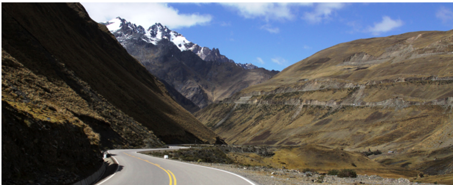
The approach to the high pass, Abra Malaga

BLACK-CHESTED BUZZARD-EAGLE ( Geranoaetus melanoleucus ) – One was seen on our first day outside of Cusco at Huacarpay Lakes. A nice adult.