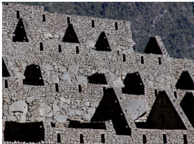
The exquisite geometry of Machu Picchu

TROPICAL KINGBIRD ( Tyrannus melancholicus )