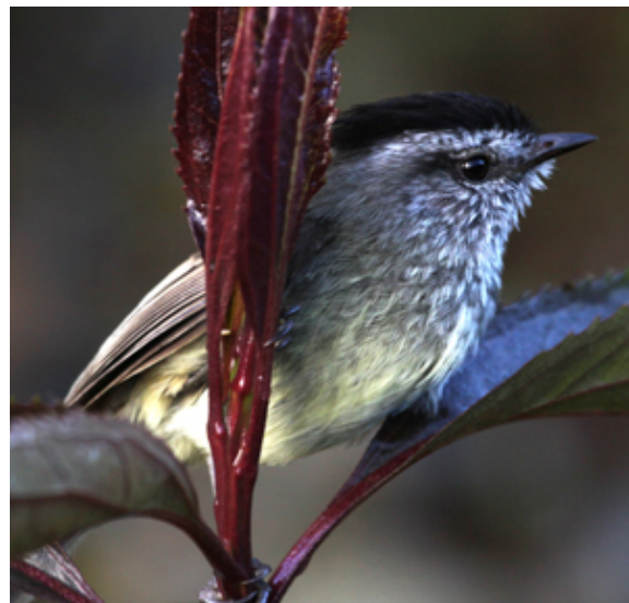
Unstreaked Tit-Tyrant

BLACK-THROATED FLOWERPIERCER ( Diglossa brunneiventris ) – Heck, all the flowerpiercers on this tour are nice looking. Most were seen on the east slope of Abra Malaga, but Rusty was also seen at our hotel in Ollantaytambo.