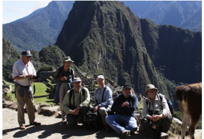
Our group at Machu Picchu

LINE-FRONTED CANASTERO ( Asthenes urubambensis ) – One of my favorite looking canasteros.