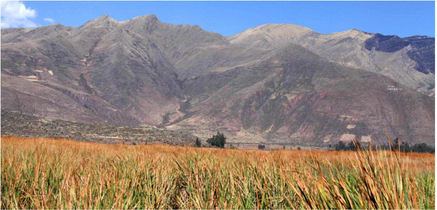
The setting at Huacarpay Marsh

GREAT THRUSH ( Turdus fuscater ) – Numerous in the highland scrub around Abra Malaga.