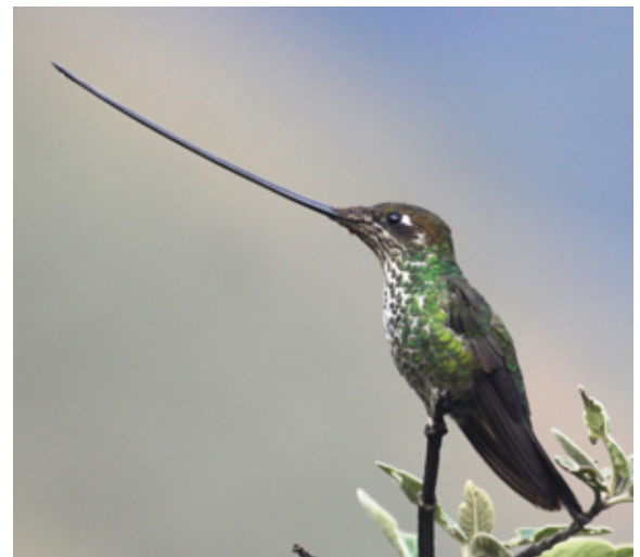
The fantastic Sword-billed Hummingbird we saw

VIOLET-THROATED STARFRONTLET ( Coeligena violifer ) – Seen on the east slope of Abra Malaga. Not many, just