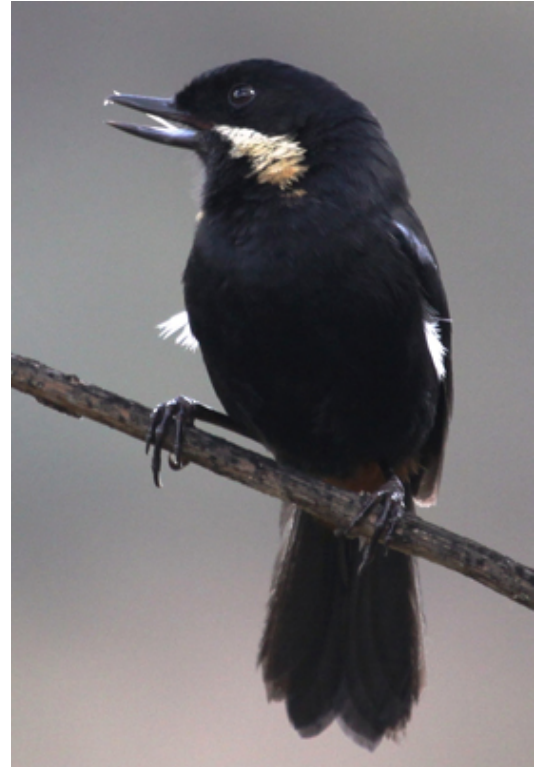
Moustached Flowerpiercer

We have more information about this itinerary and future departures on our web page for Machu Picchu & Abra Malaga, Peru .