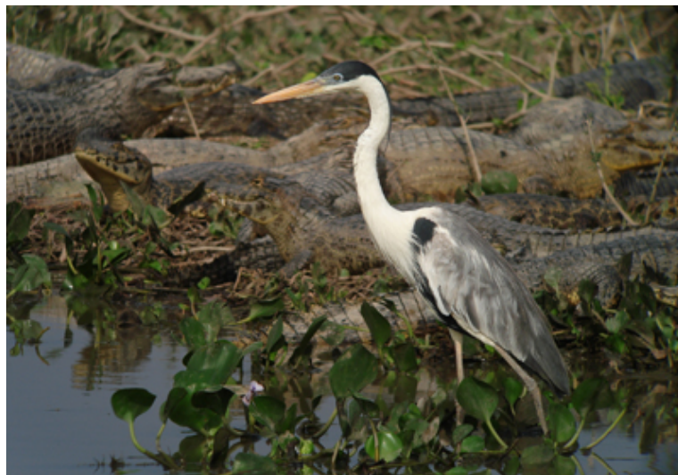
Cooi Heron

WHITE-NECKED JACOBIN ( Florisuga mellivora ) LONG-TAILED HERMIT ( Phaethornis superciliosus ) BUFF-BELLIED HERMIT ( Phaethornis subochraceus ) – A couple of nice views of this rather scarce hermit, in the Pantanal. BLACK-EARED FAIRY ( Heliothryx auritus ) WHITE-TAILED GOLDENTHROAT ( Polytmus guainumbi ) BLACK-THROATED MANGO ( Anthracothorax nigricollis ) FRILLED COQUETTE ( Lophornis magnificus ) – Two seen well near Chapada, where seldom reported. LONG-BILLED STARTHROAT ( Helimaster longirostris ) AMETHYST WOODSTAR ( Calliphlox amethystina ) – This little gem was seen well a couple of times. GRAY-BREASTED SABREWING ( Campylopterus largipennis ) SWALLOW-TAILED HUMMINGBIRD ( Eupetomena macroura ) FORK-TAILED WOODNYMPH ( Thalurania furcata ) VERSCOLORED EMERALD ( Amazilia versicolor ) GLITTERING-THROATED EMERALD ( Amazilia fimbriata ) RUFIOUS-THROATED SAPPHIRE ( Hylocharis sapphirina ) WHITE-CHINNED SAPPHIRE ( Hylocharis cyanus ) GILDED HUMMINGBIRD ( Hylocharis chrysura )