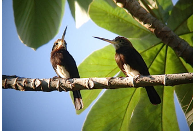
Two Brown Jacamars seen nicely from one of our boat trips along the Cristalino

Our tour got off to a great start with a visit to Chapada dos Guimaraes, where late-afternoon light perfectly illuminated the massive red-rock cliffs capped with cerrado woodland and scrub. One of the first birds we saw as a group, next morning, was a singing Pheasant Cuckoo, always a crowd-and-guide-pleaser. Many birds in these habitats were quite different from those encountered in rainforests around Alta Floresta and later, in the Pantanal. Highlights included excellent views of Curl-crested Jays, a rowdy group of White Woodpeckers, a surprised Rufous Nightjar during the day, very close Rusty-backed Antwrens and Rufous-winged Antshrikes, a close encounter with Sharp-tailed Streamcreeper, both species of suiriri flycatchers for convenient comparison, and a handsome male Coal-crested Finch. We also had fine views of a Spot-backed Puffbird, the first of a Field Guides record-breaking 13 species of puffbirds we would record on the trip (Collared being heard only, darn it!!) Conditions were drier than usual, so there was little song and no response at all from regulars like Collared Crescentchest, and no flowers for hummers.