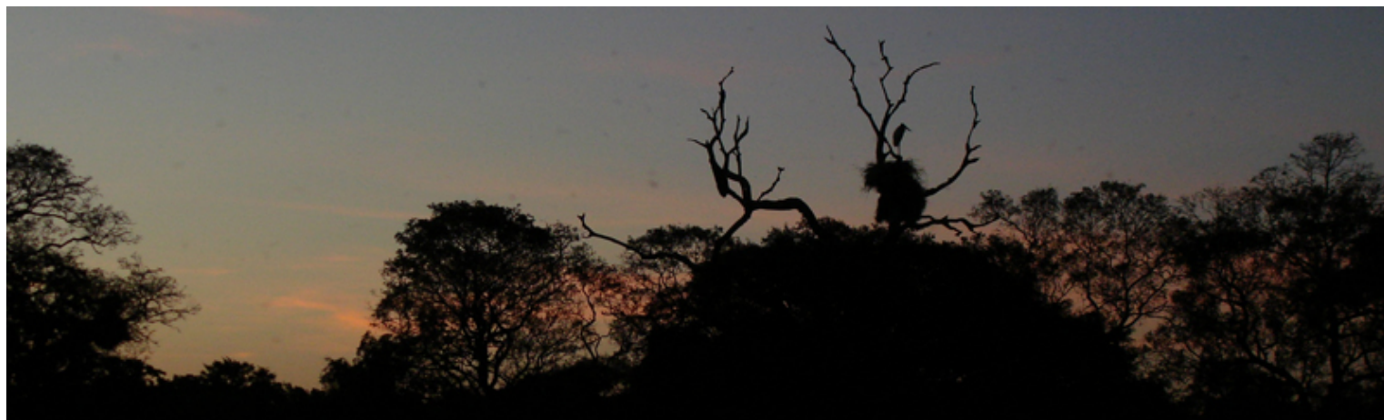
A Jabiru on a nest at sunset in the Pantanal

RUDDY GROUND-DOVE ( Columbina talpacoti )