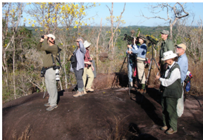
Our group birding atop the Serra trail