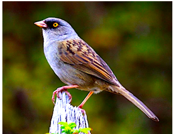
Many species of birds are restricted to the highlands of Costa Rica and Panama, and are collectively referred to as "Chiriqui endemics". Among these is the Volcano Junco, a bird of the highest mountain tops, like at the crater on Volcan Irazu, where this one crashed our picnic lunch.

BARRED ANTSHRIKE ( Thamnophilus doliatus ) – One briefly near Rancho Bajo.