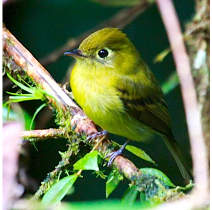
Yellowish Flycatcher has always seemed an odd name for the most yellow of all the Empidonax. Yellowest Flycatcher might be more appropriate.

GRAY-HEADED KITE ( Leptodon cayanensis ) – An immature was soaring over the Rio Tuis during our morning walk.