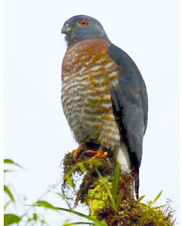
It's not often you can see the notch on the bill that gives the Double-toothed Kite its name, but this bird gave us a great view of that feature at Tapanti NP.

WHITE-WINGED DOVE ( Zenaida asiatica ) – Now common in San Jose and Cartago. This one moved in from the north.