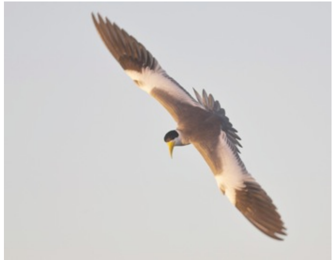
A beautifully patterned Large-billed Tern wheels around for a better view.

BLACK-NECKED STILT (WHITE-BACKED) ( Himantopus mexicanus melanurus )