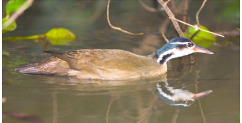
What a welcome to the Pantanal; our first morning there was highlighted by this super cooperative Sungrebe foraging close to shore!

GUIRA CUCKOO ( Guira guira ) – What an odd looking bird. One of my favorite birds to watch for behavior.