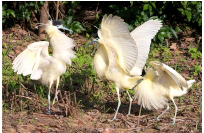
"Mine are bigger than yours"- A trio of juvenile Capped Herons argue over who has the longest head plumes.

BARE-FACED CURASSOW ( Crax fasciolata ) – It is so nice to see Curassows wondering about without fear of humans, like we do in the Pantanal. Always a sign of no poaching.