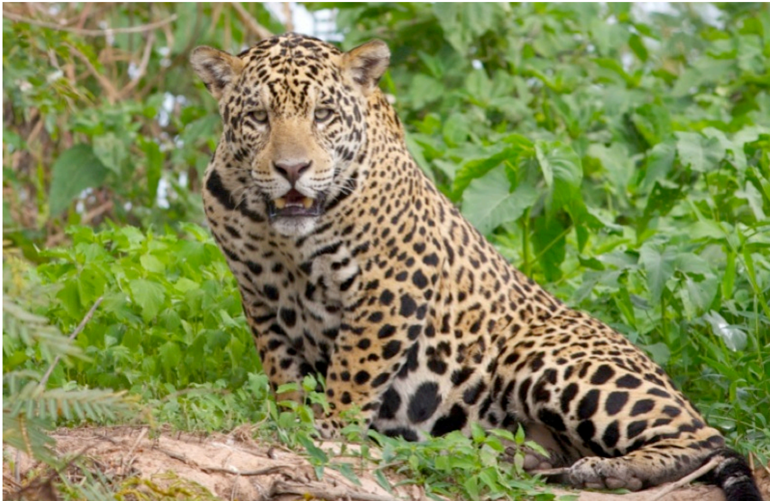
The first of two male jaguars spotted on the tour!

Jul 23, 2011 to Aug 3, 2011 Marcelo Padua