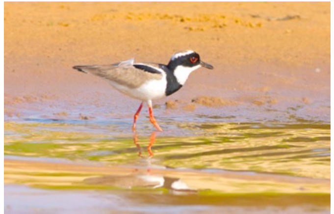
A striking Pied Lapwing wades through the shallows.

SNAIL KITE ( Rostrhamus sociabilis ) – Very common in the pantanal where they feed on fresh water crabs as much as they feed on snails.