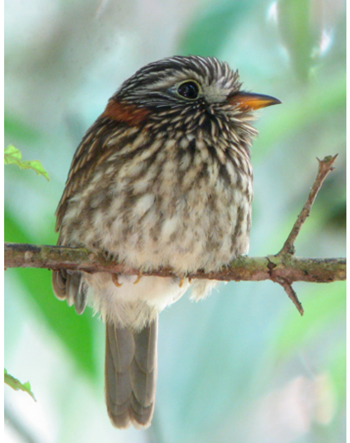
A lovely view of a Semicollared Puffbird