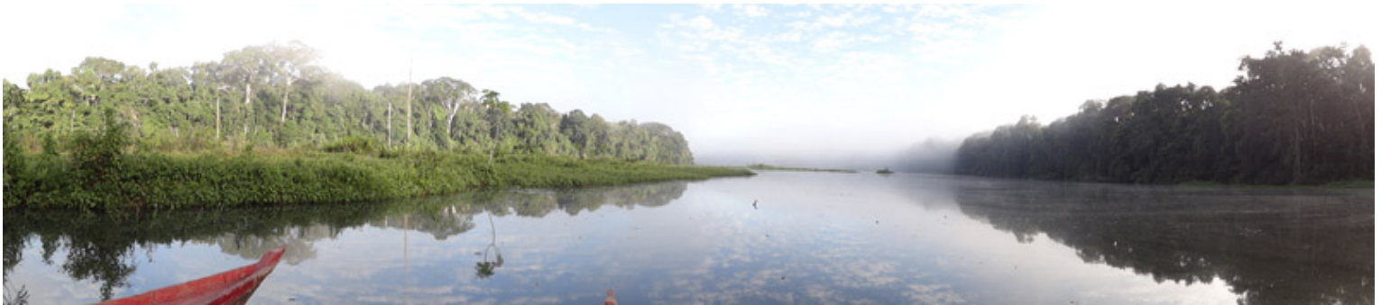
A great way to spend a relaxing morning is coasting around a cocha (oxbow lake) on a raft.

RUFESCENT TIGER-HERON ( Tigrisoma lineatum )