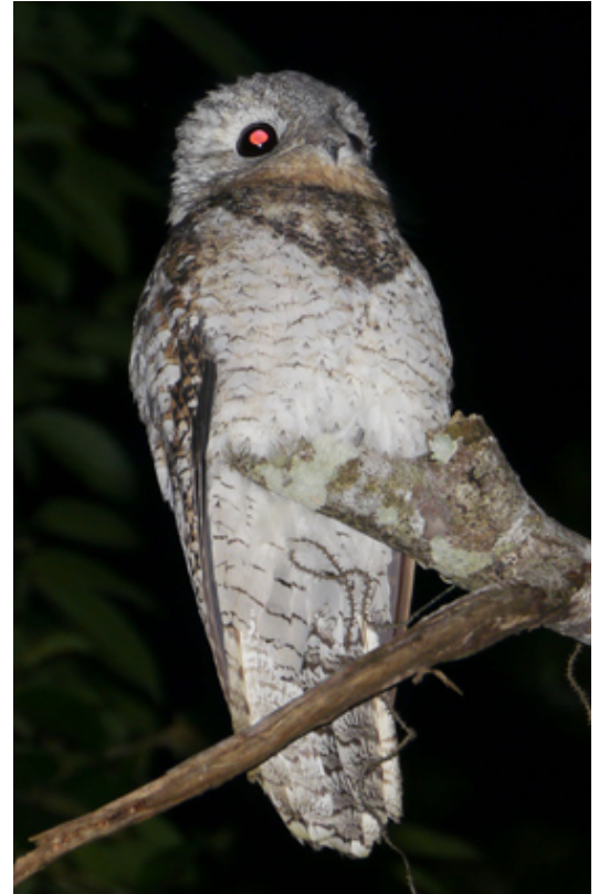
Great Potoo

CRIMSON-CRESTED WOODPECKER ( Campephilus melanoleucos )