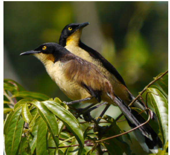
A pair of Black-capped Donacobius

GRAY-RUMPED SWIFT ( Chaetura cinereiventris ) – A few mixed in with other swifts by the Camungo tower.