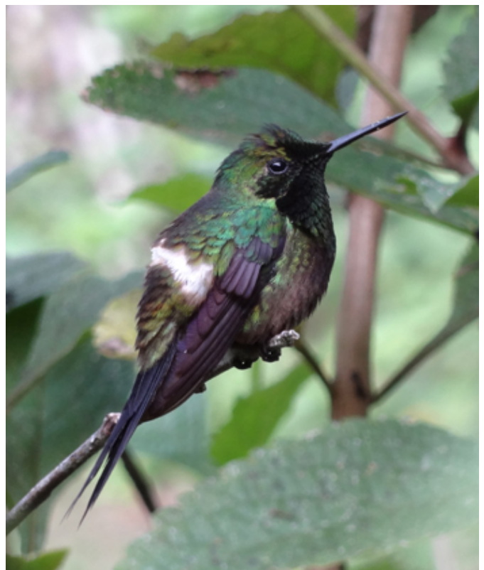
A very elegant Black-bellied Thorntail