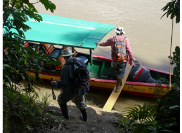
Boarding the boat

WHITE-CHINNED SAPPHIRE ( Hylocharis cyanus ) – A somewhat rare species in Peru, but one we had them regularly at the MWC feeders and flowers, and even enjoyed the song of a male while walking in the forest.