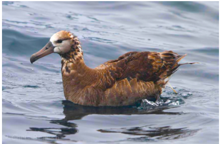
The rich waters off the California coast make a pelagic trip a must; how else are you going to come face-to-beak with the incredible Black-footed Albatross?