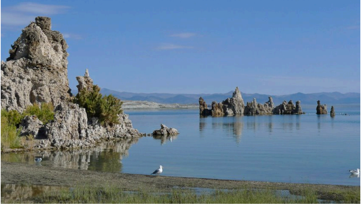
The spectacular tufa rock formations of Mono Lake provide a scenic backdrop for birding the western edge of the Great Basin.

I always enjoy guiding trips to California because it gives me an opportunity to get back to my old stomping grounds and to share some of those species that meant so much to me when I was just a kid. This tour packs quite a wallop: by doing a transect across the heart of central California, one has the opportunity to do a terrific west coast pelagic, see plenty of shorebirds on the coast, and then head inland to bird along the edge of the great central valley, both slopes of the Sierra Nevada mountains, and the western edge of the Great Basin. The result? Lots of great birds and other wildlife.