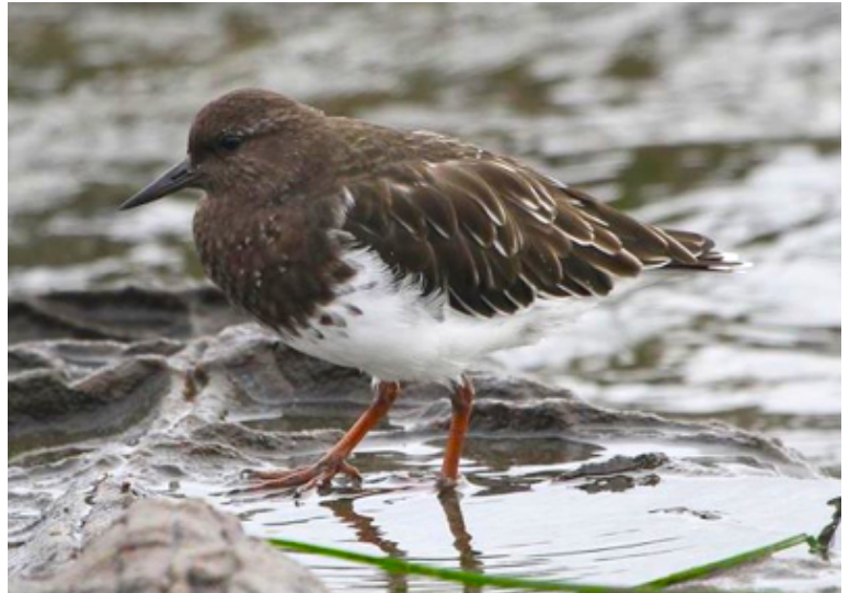
This Black Turnstone may be in non-breeding dress, but it's a classy bird nonetheless.

BALD EAGLE ( Haliaeetus leucocephalus ) – Kim had a knack for spotting eagles. She spotted all of these and all of the