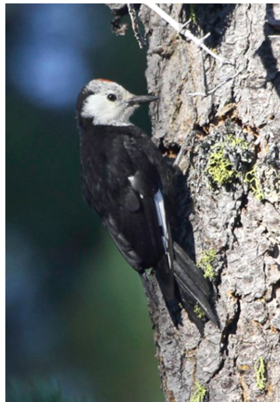
The biggest prize among the 10 species of woodpecker we saw on the trip was this highly coveted White-headed Woodpecker, always a fan favorite.