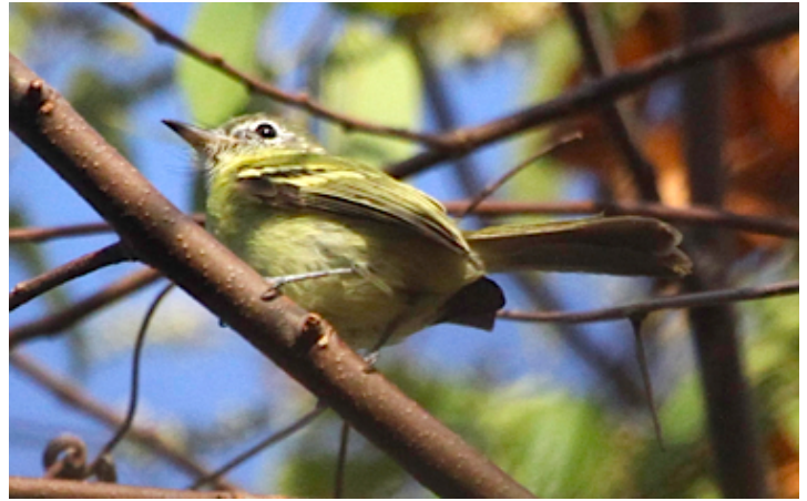
Panama has only a handful of endemic bird species, and this is the only one of those to occur in the Canal Zone- the Yellow-green Tyrannulet.