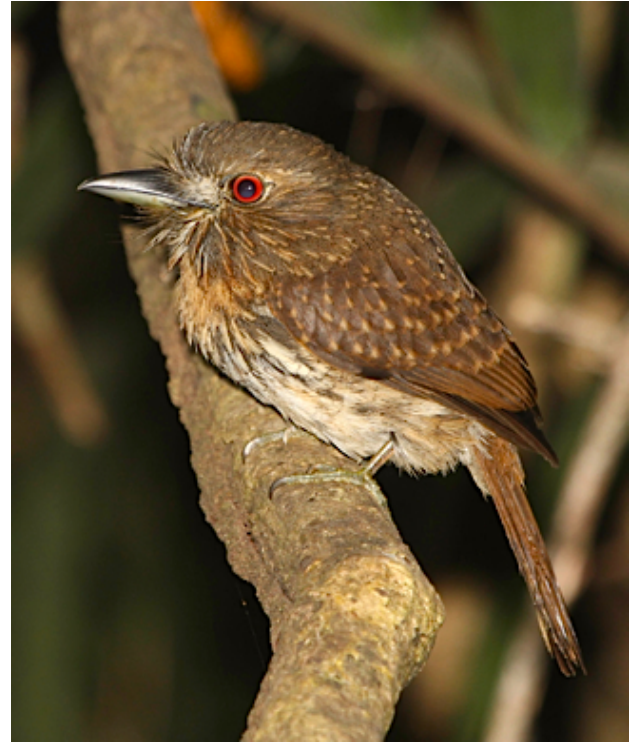
One of 4 species of puffbird on the trip, the White-whiskered Puffbird is often seen during the walk down Semaphore Hill.

SPOT-CROWNED BARBET ( Capito maculicoronatus ) – Terrific views of one along the Achote Road where it appeared