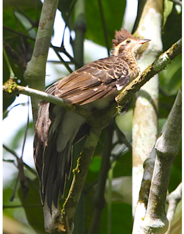
Pheasant Cuckoos are incredibly elusive, and seldom encountered unless they're singing; the Canal Zone is among the best places to see one.

SPECTACLED OWL ( Pulsatrix perspicillata ) – A pair of birds roosting together along the Old Gamboa Road.