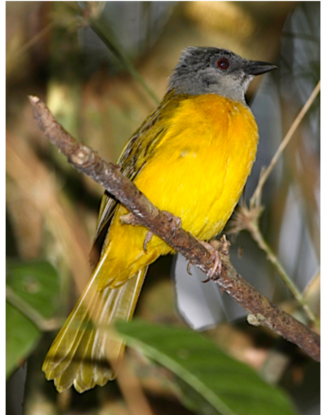
The handsome Gray-headed Tanager is a regular follower of army ant swarms, competing for insects with several species of attending antbirds and woodcreepers.