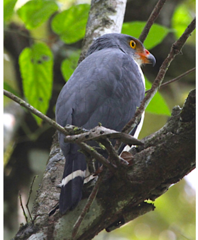
The plumbeous half of the gorgeous Semiplumbeous Hawk.