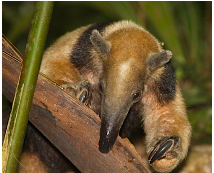
In addition to the abundant bird life, the Canal Zone is also great for seeing mammals, such as this near-sighted Northern Tamandua which nearly blundered into us along Pipeline Road!

BLACK-AND-WHITE WARBLER ( Mniotilta varia ) [b]